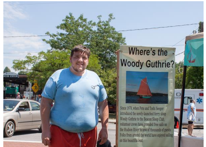
Our president after completing the river swim