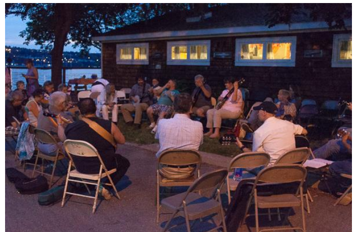
The Circle of Song on a beautiful night down by the riverside

NEXT EXEC. COM. MEETING IS Tuesday, July. 28th 7:00 p.m.